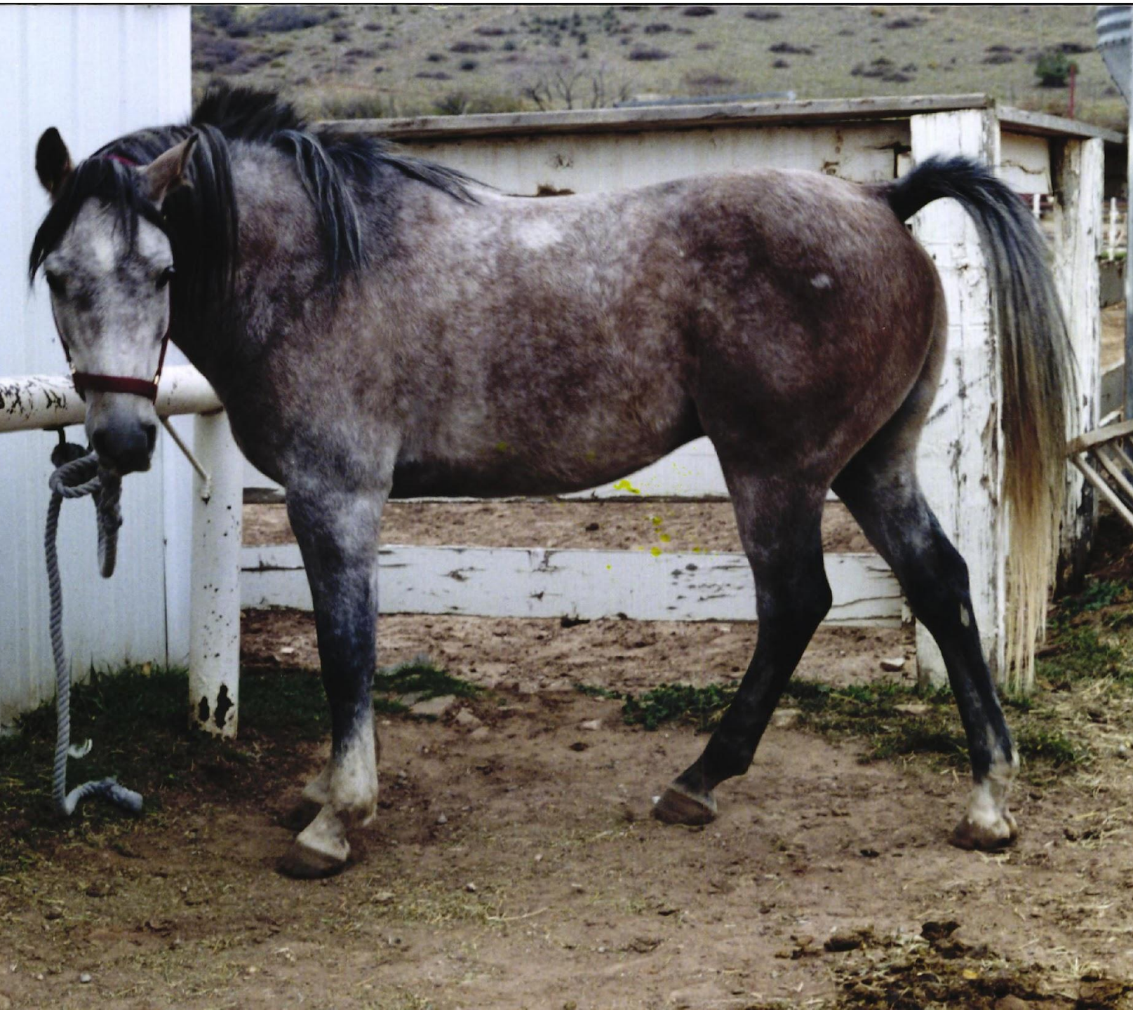
PJ as a young horse