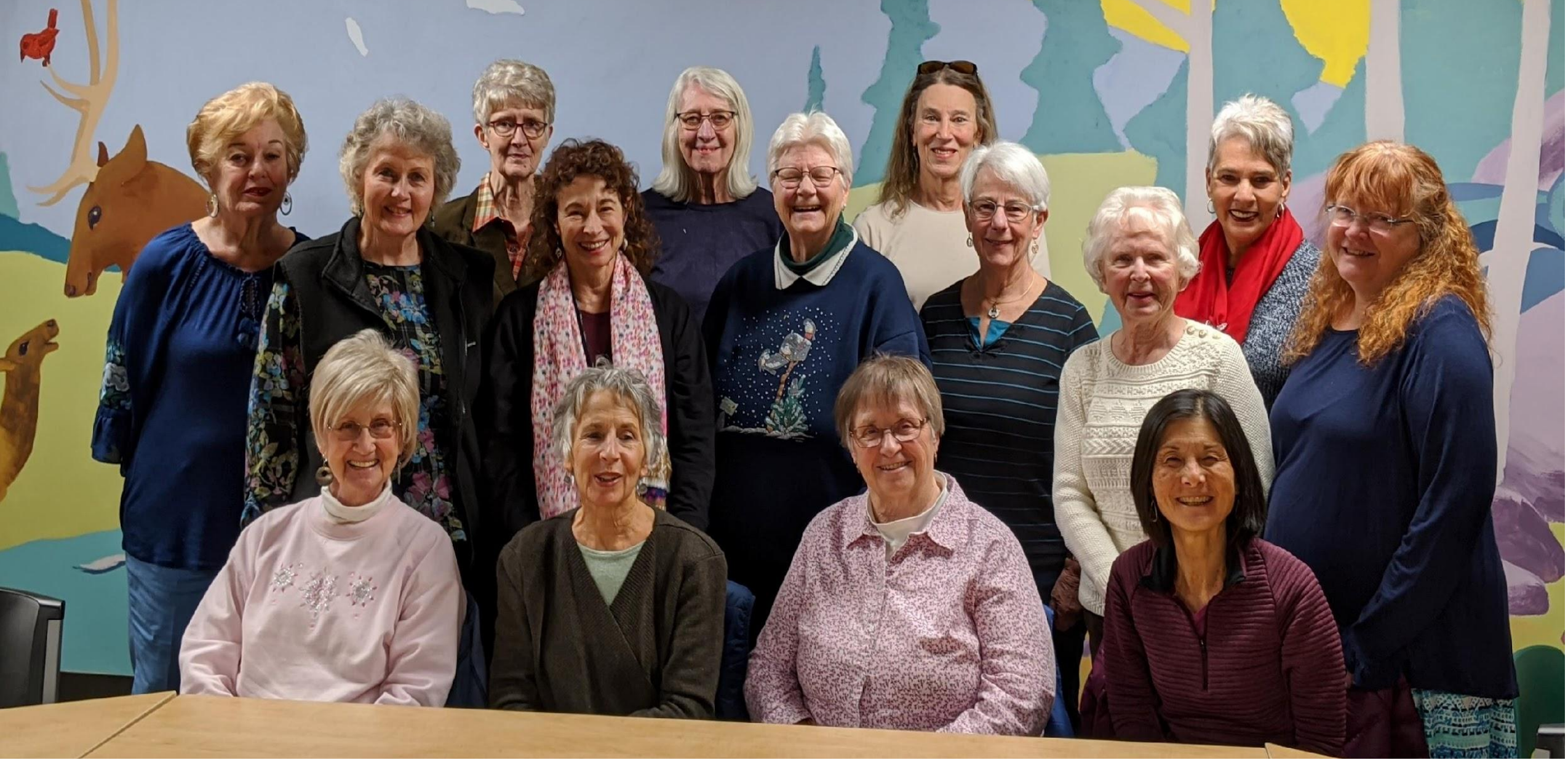
WISE WOMEN GROUP 2020